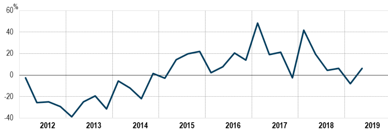
CHART 3. FLOOR AREA OF NEW NON-RESIDENTIAL BUILDINGS Q1 2012 – Q2 2019, quarter on same quarter a year ago percentage changes (a)

(a) Provisional data starting from I quarter 2019