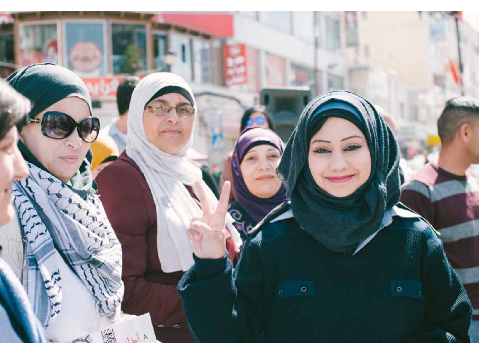
A young Palestinian policewoman raises public awareness on how police protect the safety and rights of women, part of a joint UN effort to ensure women access justice.

Across the diverse organizations of the UN system, UN Women leads a coordinated approach to gender equality. In programmes and operations, we emphasize the centrality of women's rights and empowerment for achieving the Sustainable Development Goals and upholding international norms and standards.