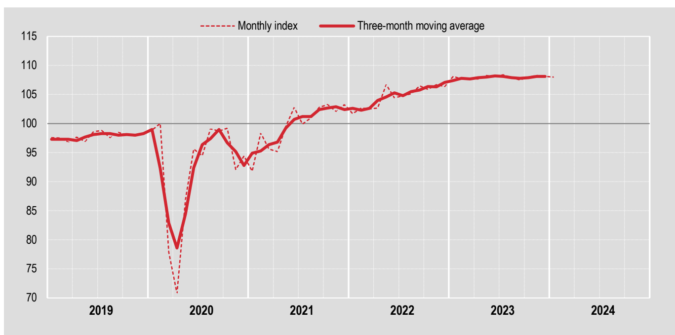
CHART 1. RETAIL TRADE, SEASONALLY ADJUSTED INDEX AND THREE-MONTH MOVING AVERAGE January 2019 – January 2024, value (index, 2021=100)