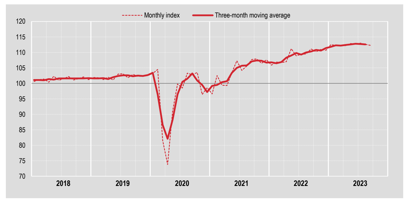
CHART 1. RETAIL TRADE, SEASONALLY ADJUSTED INDEX AND THREE-MONTH MOVING AVERAGE January 2018 – September 2023, value (index, 2015=100)