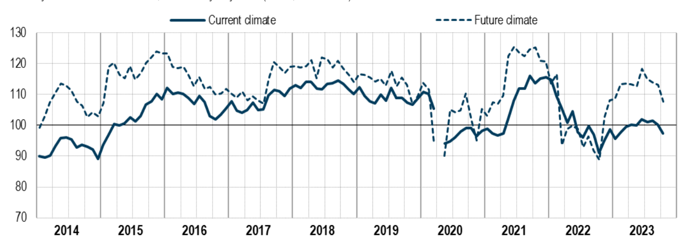
CHART 4. BUSINESS CONFIDENCE CLIMATE INDEX BY ECONOMIC SECTOR

January 2014 – October 2023, seasonally adjusted (index, 2010=100)