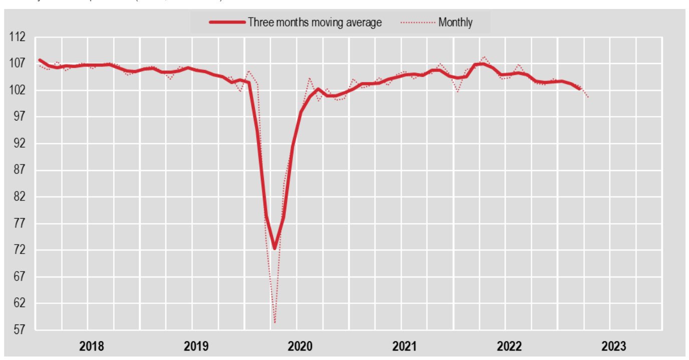
CHART 1. INDUSTRIAL PRODUCTION, SEASONALLY ADJUSTED INDEX AND THREE-MONTH MOVING AVERAGE January 2018 - April 2023 (index, 2015=100)