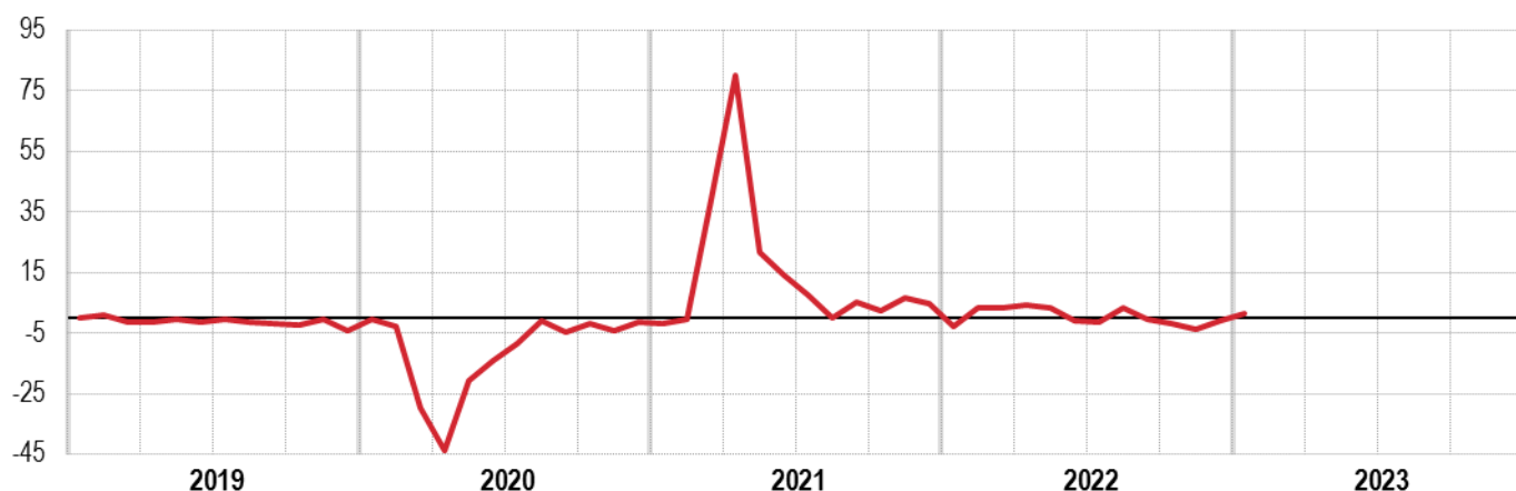
TABLE 1. INDUSTRIAL PRODUCTION INDICES (a), MONTHS ON PREVIOUS MONTHS AND ON SAME MONTHS A YEAR AGO PERCENTAGE CHANGES

January 2019 – January 2023, calendar adjusted data (index, 2015=100)