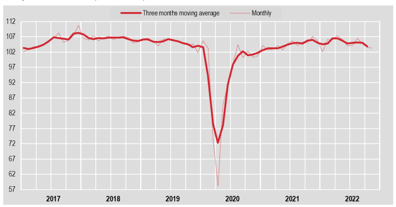
CHART 1. INDUSTRIAL PRODUCTION, SEASONALLY ADJUSTED INDEX AND THREE-MONTH MOVING AVERAGE January 2017 – November 2022 (index, 2015=100)