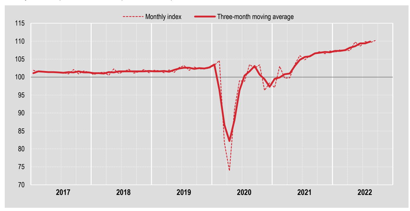
CHART 1. RETAIL TRADE, SEASONALLY ADJUSTED INDEX AND THREE-MONTH MOVING AVERAGE January 2017 – September 2022, value (index, 2015=100)