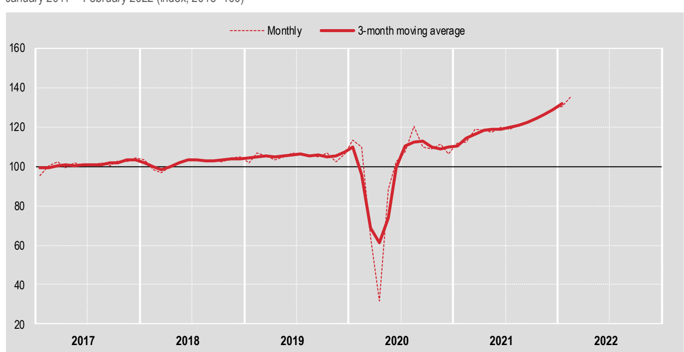
CHART 1. PRODUCTION IN CONSTRUCTION, SEASONALLY ADJUSTED INDEX AND THREE-MONTH MOVING AVERAGE January 2017 – February 2022 (index, 2015=100)