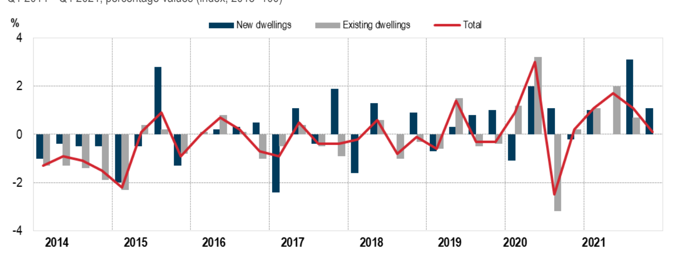
CHART 3. HOUSE PRICE INDICES HPI, QUARTER ON SAME QUARTER A YEAR AGO PERCENTAGE CHANGES Q1 2014 – Q4 2021, percentage values (index, 2015=100)