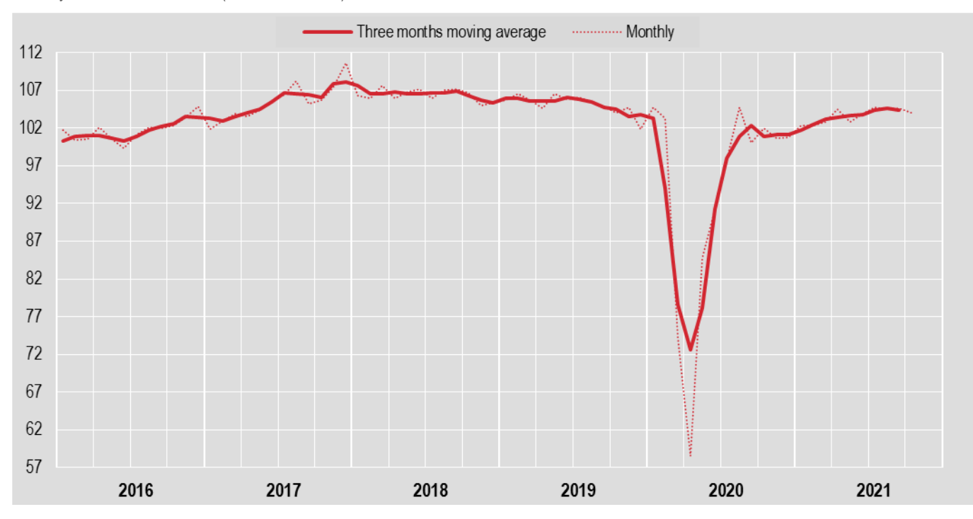
CHART 1. INDUSTRIAL PRODUCTION, SEASONALLY ADJUSTED INDEX AND THREE-MONTH MOVING AVERAGE January 2016 – October 2021 (index, 2015=100)