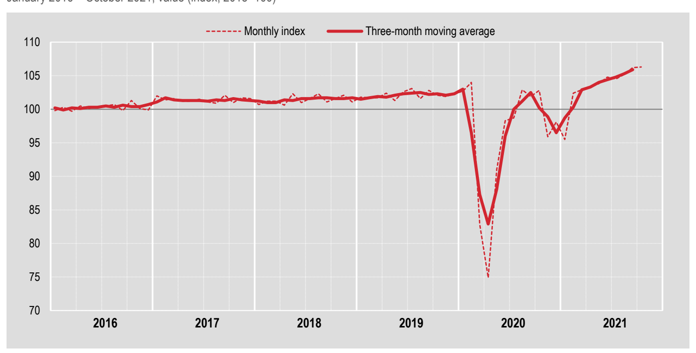
CHART 1. RETAIL TRADE, SEASONALLY ADJUSTED INDEX AND THREE-MONTH MOVING AVERAGE January 2016 – October 2021, value (index, 2015=100)