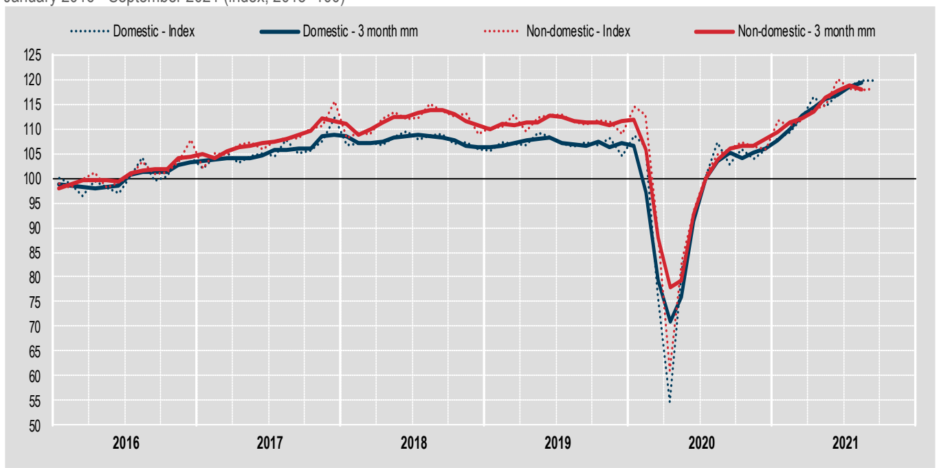
CHART 3. INDUSTRIAL TURNOVER, MONTH ON SAME MONTH A YEAR AGO PERCENTAGE CHANGES January 2017 - September 2021, calendar adjusted data (index, 2015=100)

January 2016 - September 2021 (index, 2015=100)