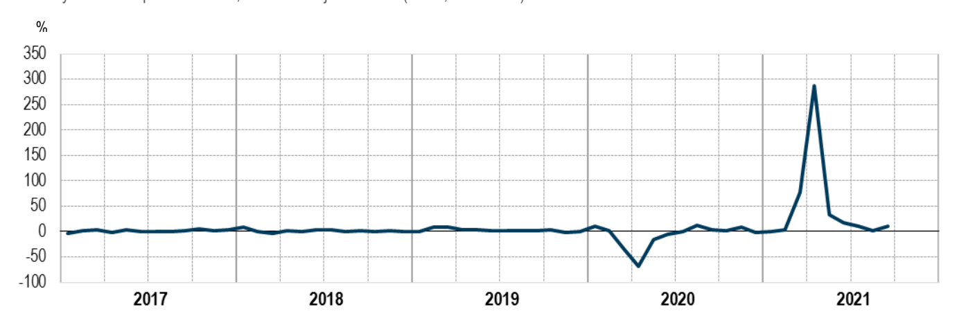
TABLE 1. PRODUCTION IN CONSTRUCTION, MONTHS ON PREVIOUS MONTHS AND ON SAME MONTHS A YEAR AGO PERCENTAGE CHANGES

September 2021 (a), seasonally adjusted, calendar adjusted and unadjusted data (index, 2015=100)