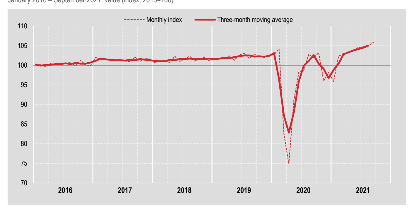
CHART 1. RETAIL TRADE, SEASONALLY ADJUSTED INDEX AND THREE-MONTH MOVING AVERAGE January 2016 – September 2021, value (index, 2015=100)