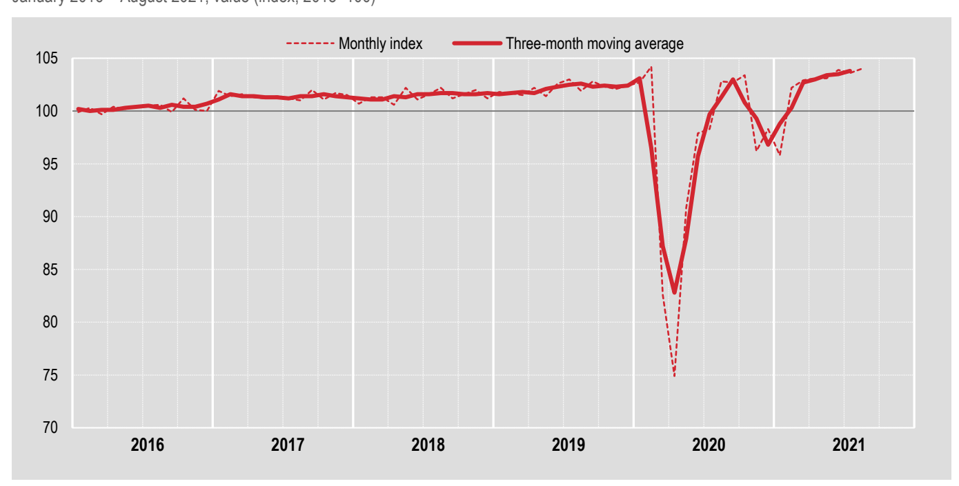
CHART 1. RETAIL TRADE, SEASONALLY ADJUSTED INDEX AND THREE-MONTH MOVING AVERAGE January 2016 – August 2021, value (index, 2015=100)