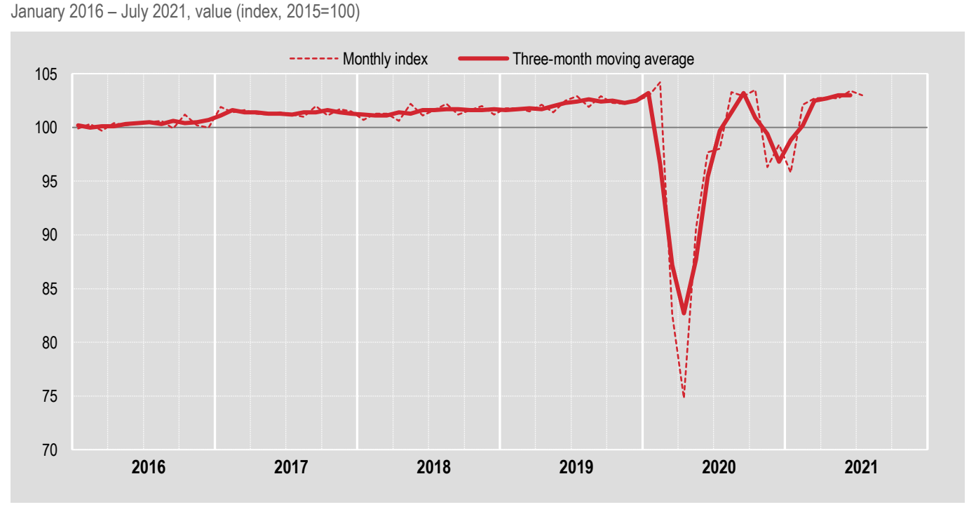
CHART 1. RETAIL TRADE, SEASONALLY ADJUSTED INDEX AND THREE-MONTH MOVING AVERAGE