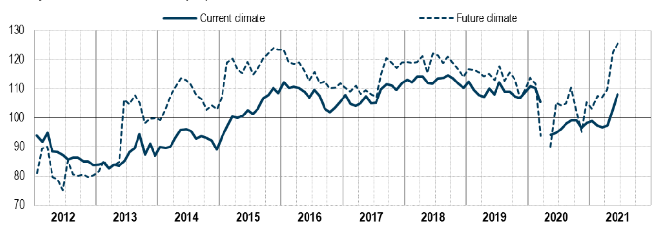
CHART 4. BUSINESS CONFIDENCE CLIMATE INDEX BY ECONOMIC SECTOR

January 2012 – June 2021, seasonally adjusted (index, 2010=100)