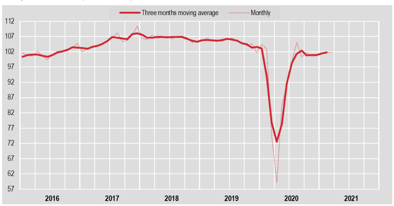
CHART 1. INDUSTRIAL PRODUCTION, SEASONALLY ADJUSTED INDEX AND THREE-MONTH MOVING AVERAGE January 2016 – March 2021 (index, 2015=100)