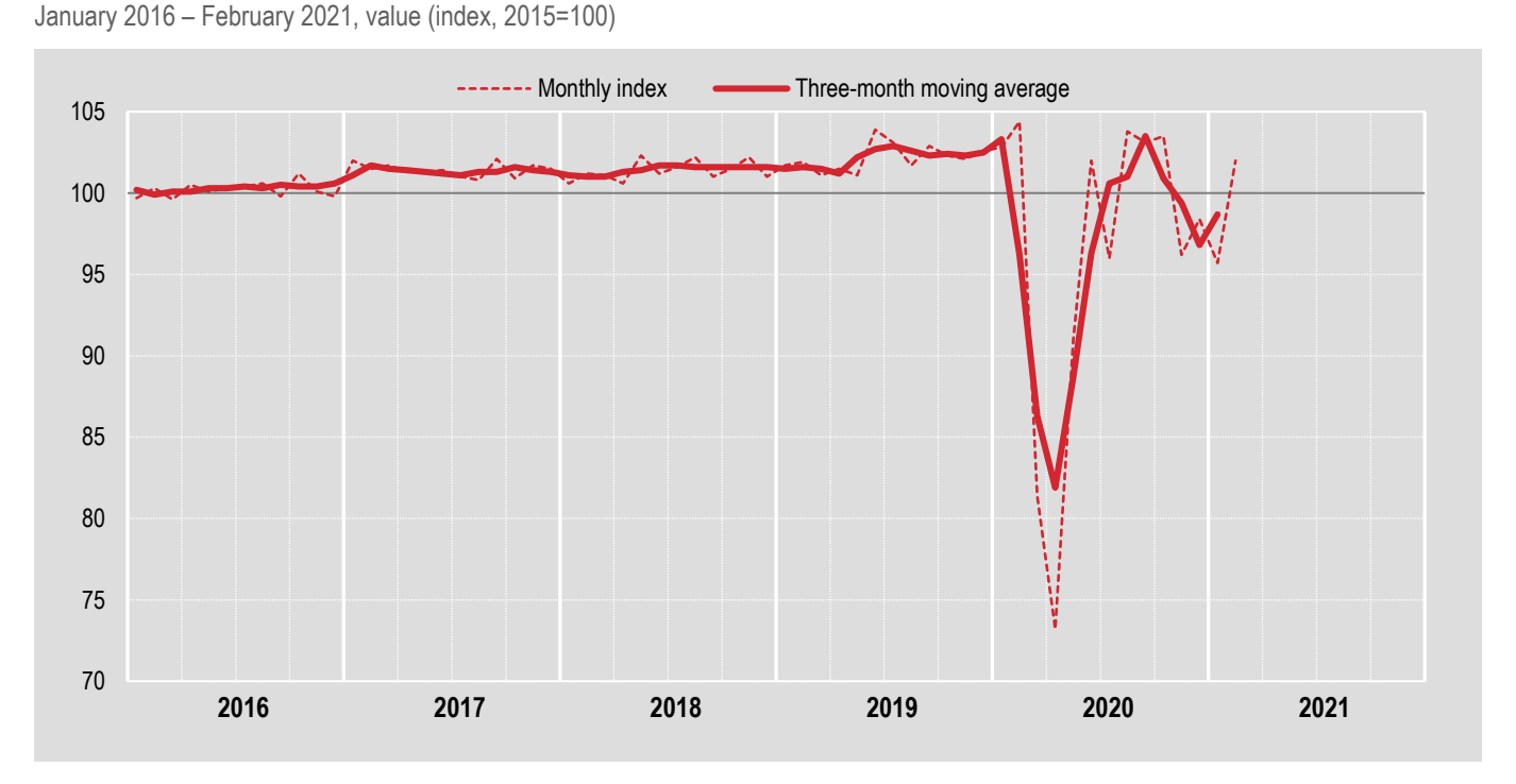
CHART 1. RETAIL TRADE, SEASONALLY ADJUSTED INDEX AND THREE-MONTH MOVING AVERAGE