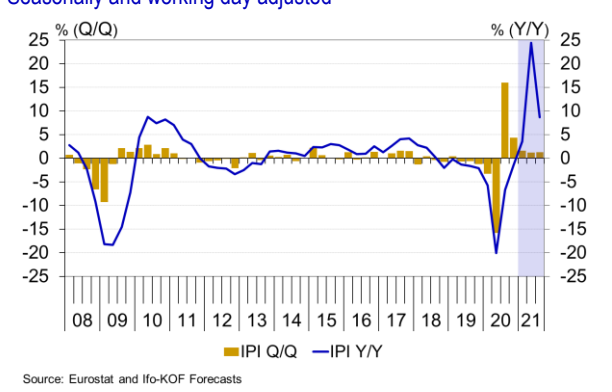
FIGURE 1 | Eurozone Industrial Production Index Seasonally and working day adjusted

In the first months of the year, the manufacturing sector has been showing positive signals. The industrial production expanded in January (+0.8% compared to the previous month) after stagnating in December. France and Italy recorded the strongest increases, whereas in