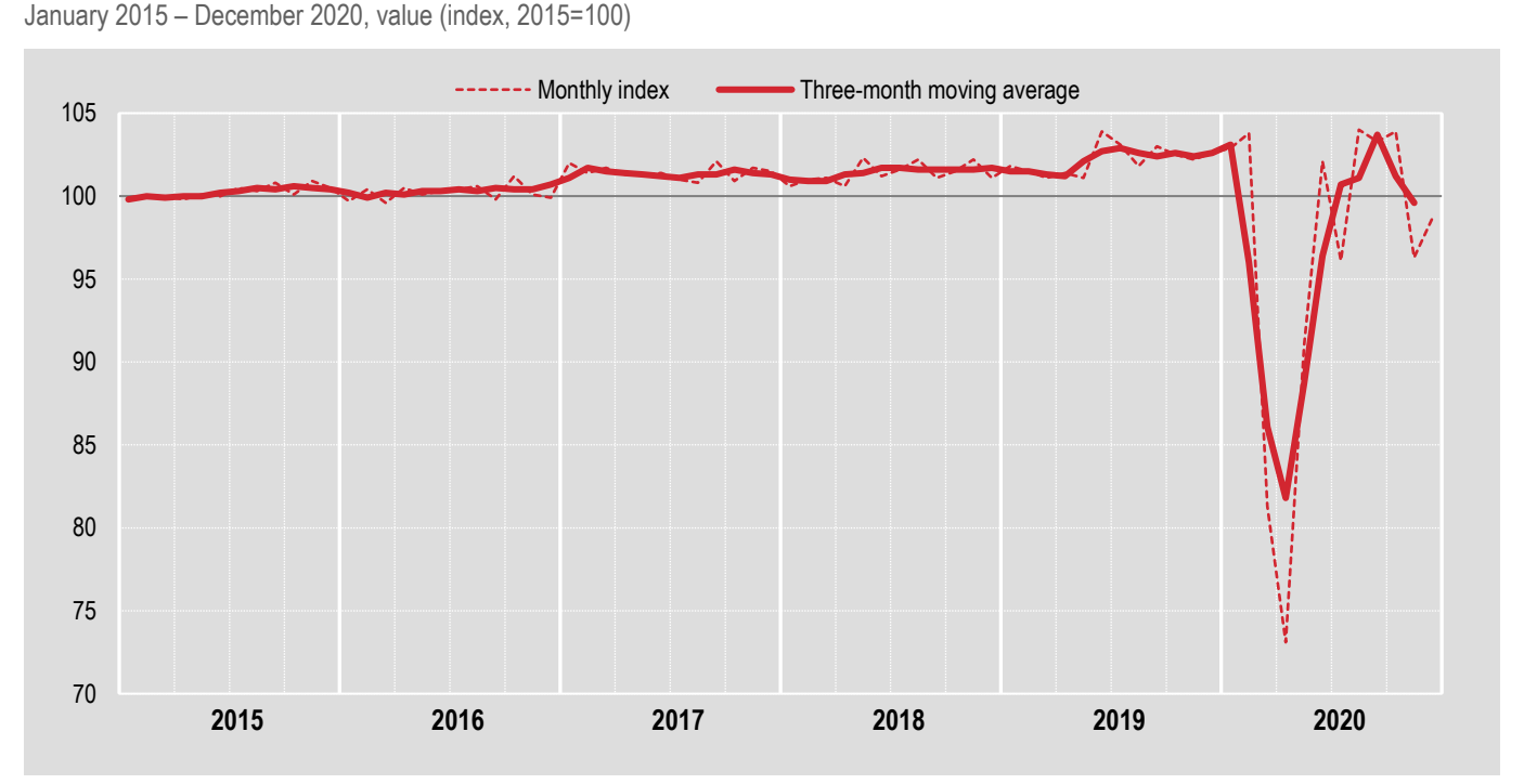
CHART 1. RETAIL TRADE, SEASONALLY ADJUSTED INDEX AND THREE-MONTH MOVING AVERAGE