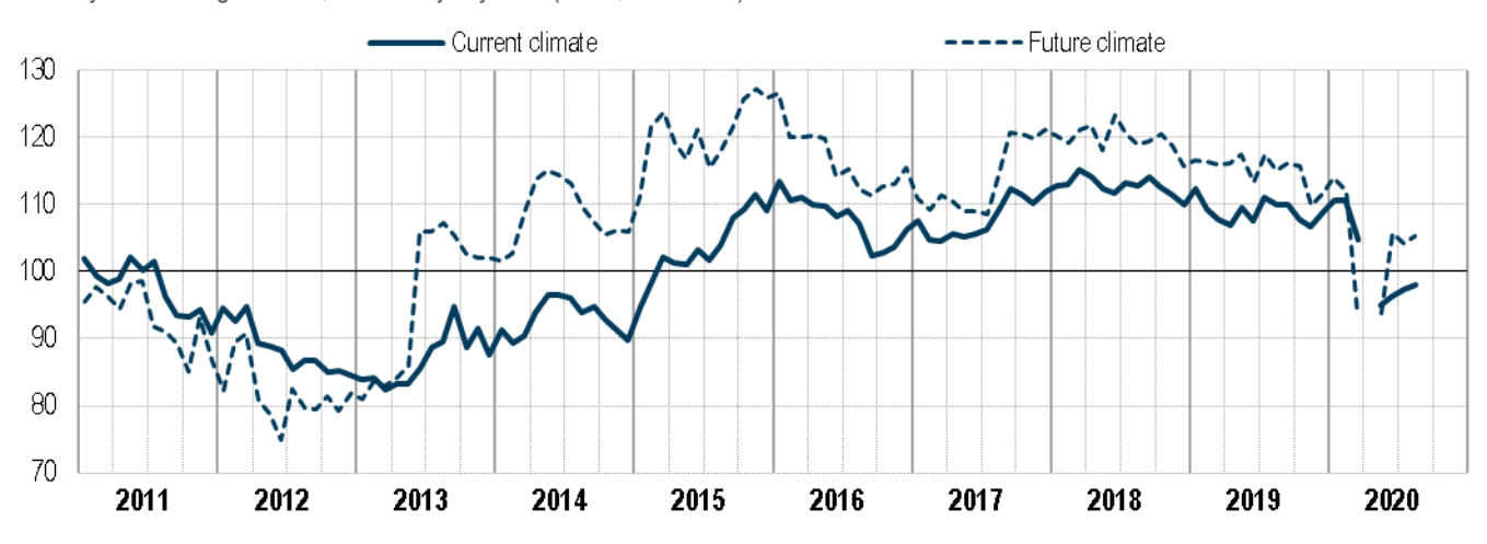
CHART 4. BUSINESS CONFIDENCE CLIMATE INDEX BY ECONOMIC SECTOR

January 2011 – August 2020, seasonally adjusted (index, 2010=100)