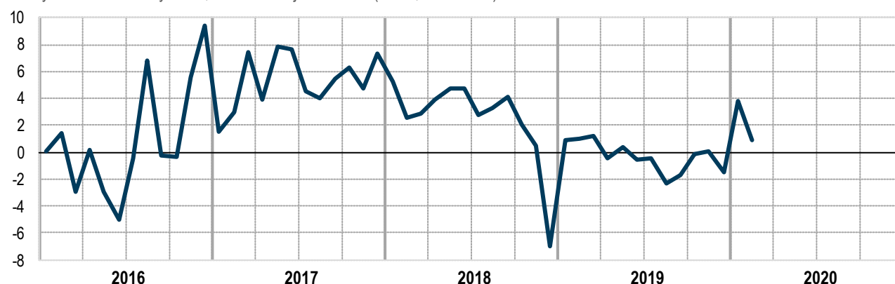
CHART 3. INDUSTRIAL NEW ORDERS, MONTH ON SAME MONTH A YEAR AGO PERCENTAGE CHANGES

January 2016 – February 2020, calendar adjusted data (index, 2015=100)