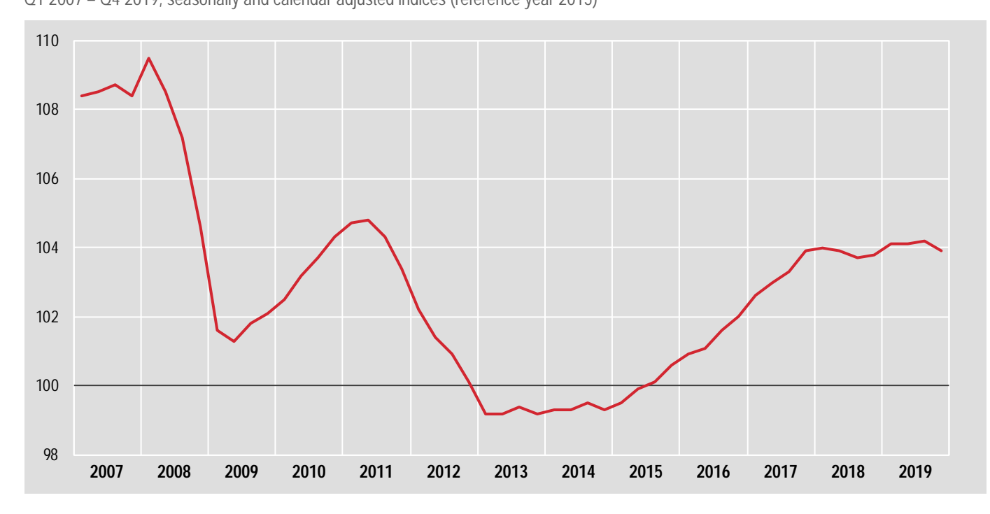
CHART 1. GROSS DOMESTIC PRODUCT, CHAIN-LINKED INDICES Q1 2007 – Q4 2019, seasonally and calendar adjusted indices (reference year 2015)