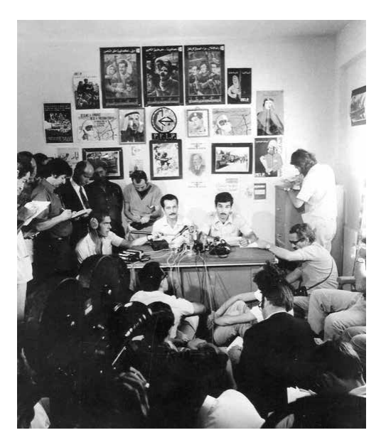
Ghassan Kanafani at a Popular Front for the Liberation of Palestine press conference. Unknown date and source.