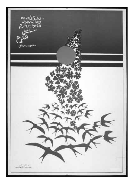
Poster by Emile Menhem, c. 1981. The Arabic is an excerpt of a poem by Mahmud Darwish, which reads, "because the storm promised me wine and new toasts and rainbows / I will go on serenading happiness." The Storm (al-'Asifa) was also the name of an armed wing of Fatah.

in the Arab world."<sup>18</sup> Salti chronicles how, because of the nature of the project: