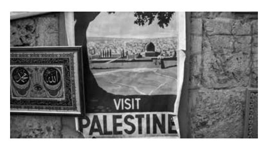
Reprint of the "Visit Palestine" poster hanging in the Old City of Jerusalem.