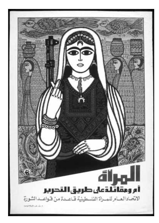
Poster by Burhan Karkutli, c. 1978. Arabic reads, "The woman. Mother and fighter on the path to liberation. The General Union of Palestinian Women is a foundation of the revolution." Published by the General Union of Palestinian Women.

An increasing number of new Palestine posters are "born digitally" and then printed and distributed locally, often in very small quantities, or they may only ever appear as a digital file on the Internet. This combination of localization and globalization represents a sea change in the way political poster art is produced and disseminated. Traditionally, political posters were printed in a single location and then distributed as hard copies. The global reach of the Internet combined with the rising costs of mass production is shifting production away from large centralized printing operations to a system controlled more by small end-users in multiple and global locations. It also allows for interesting reworkings and remixes of images and iconography from earlier posters, reincarnated in digital and print forms, as will be detailed in the third part of this essay.