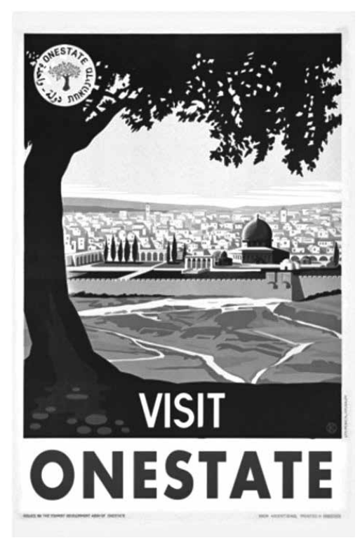
OneState Poster, 2009.

has not been revived, reprinted, or remixed, perhaps either because the location is more ambiguous or because it was not reprinted in the 1990s by Tartakover.<sup>29</sup>