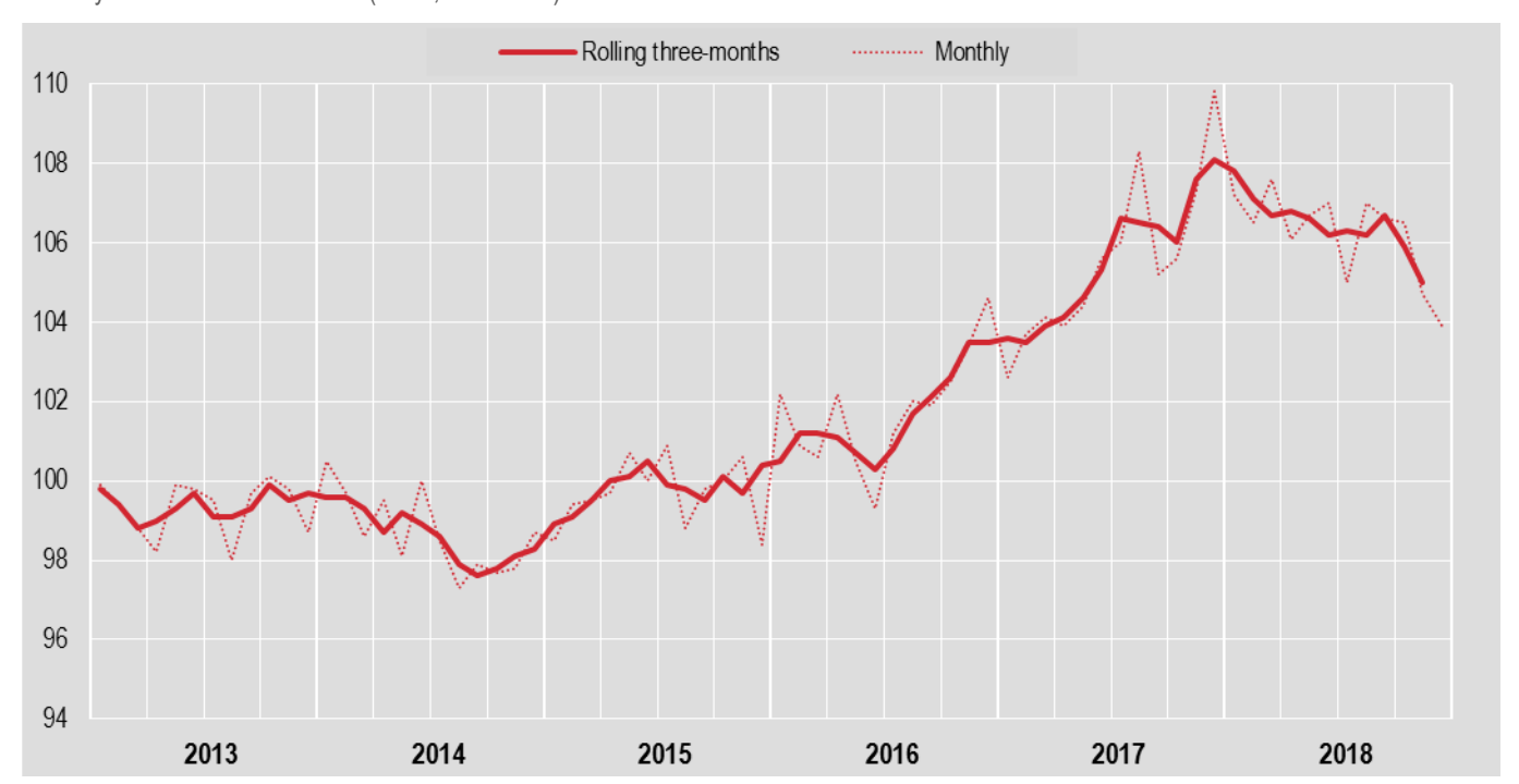
CHART 1. INDUSTRIAL PRODUCTION, SEASONALLY ADJUSTED INDEX AND THREE MONTHS MOVING AVERAGE January 2013 – December 2018 (index, 2015=100)