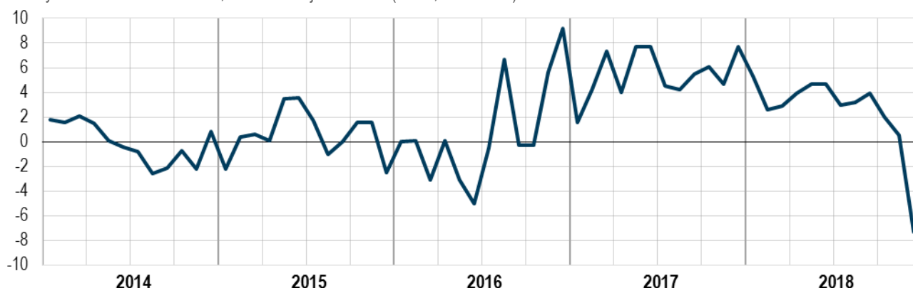
CHART 3. INDUSTRIAL NEW ORDERS, MONTH ON SAME MONTH A YEAR AGO PERCENTAGE CHANGES

January 2014 – December 2018, calendar adjusted data (index, 2015=100)