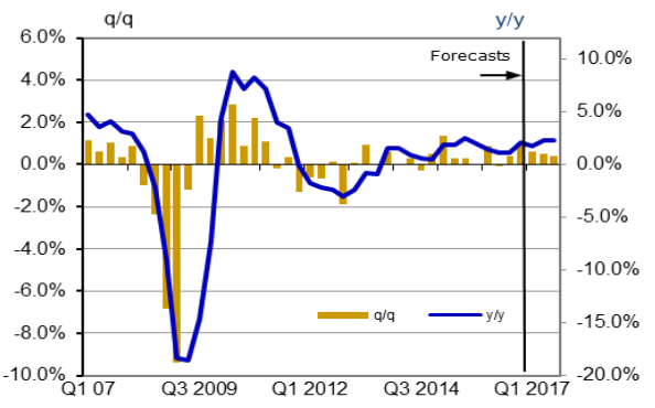
FIGURE 1 | Eurozone Industrial Production Index Seasonally and working day adjusted