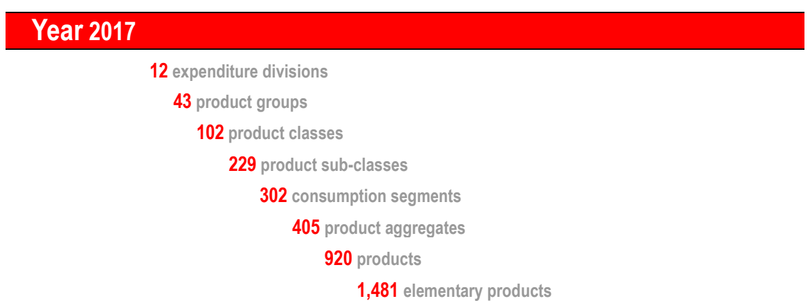
TABLE 1. CLASSIFICATION NIC AND FOI INDICES. YEAR 2017

The 2017 basket for the Italian harmonized index of consumer prices (HICP) is made up of 1,498 elementary products, which are grouped into 923 products and then into 409 product aggregates (1,484 in 2016 grouped into 906 products and 404 product aggregates)<sup>3</sup>.