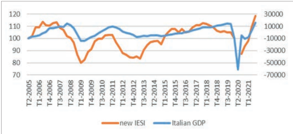
Figure 6.1 - New Istat Economic Sentiment Indicator (new IESI) and Italian GDP (a) - 2005Q2-2021Q3

(a) GDP cyclical component obtained using the Hodrick and Prescott filter.