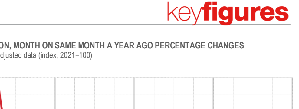
CHART 2. INDUSTRIAL PRODUCTION, MONTH ON SAME MONTH A YEAR AGO PERCENTAGE CHANGES

January 2020 – January 2024, calendar adjusted data (index, 2021=100)